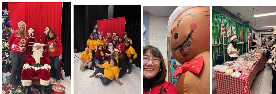
At St. Veronica Catholic Elementary School Advent Luncheon – whole school gathered to have lunch together